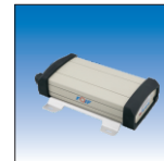
A100 Reference Receiver