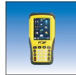
F58 GNSS Handheld