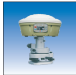
A3 Static Receiver